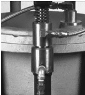
Closed gas transfer assembly